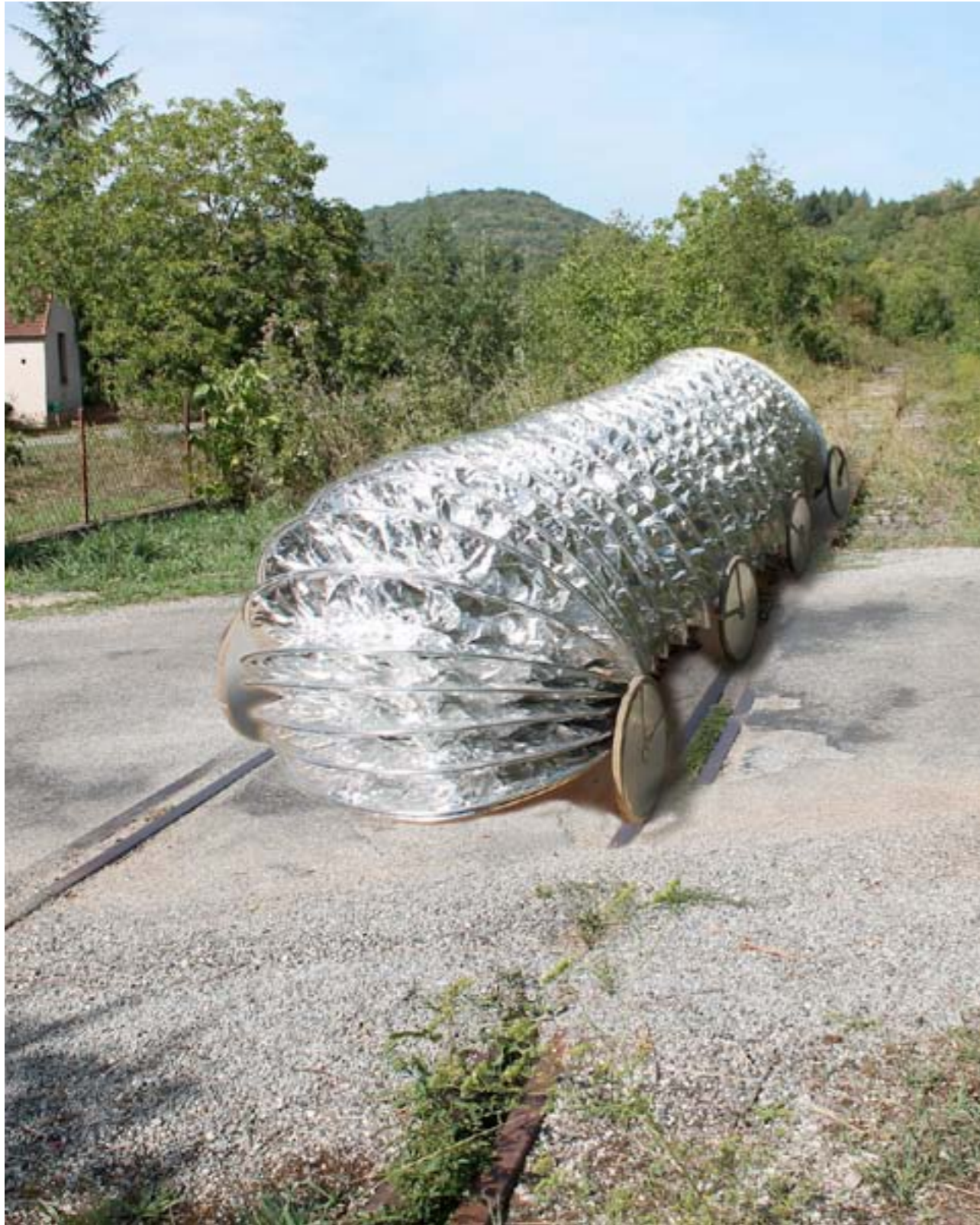
Centipède HeHe 2016 Electric bicycles, aluminium, different materials digital mounted image With the support of DICREAM